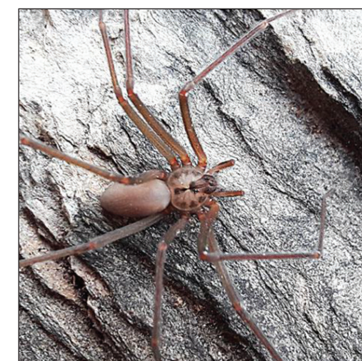
Loxosceles malintzi Valdez-Mondragón et al., sp. n.