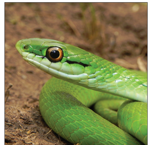
Philodryas aestiva Duméril et al., 1854