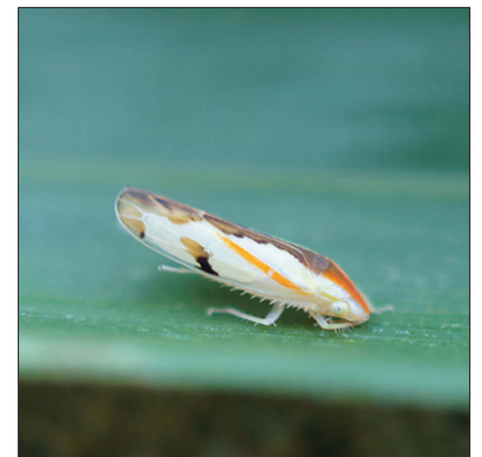
Neomohunia sinuatipenis Luo, Yang & Chen, sp. n.