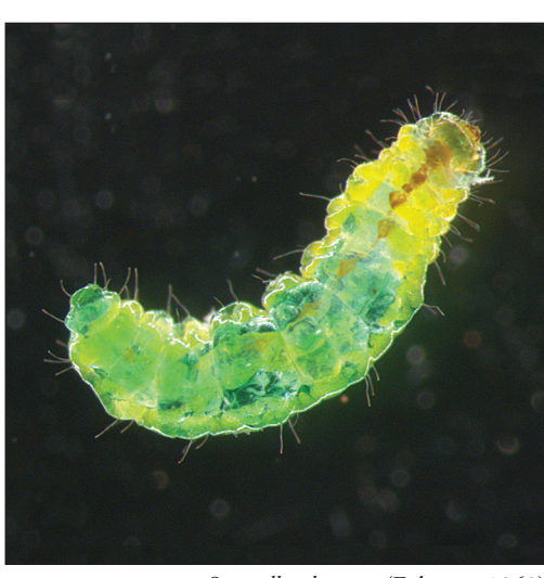
Stigmella ulmivora (Fologne, 1860)