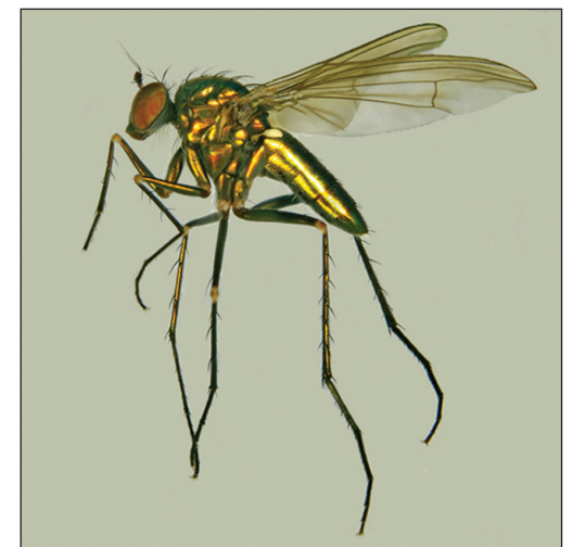
Orthoceratium lacustre Scopoli, 1763