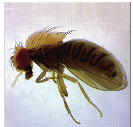
Drosophila (Dudaica) gracilipalpis Katoh & Gao, sp. n.