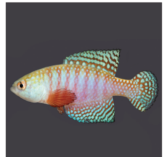
Hypsolebias hamadryades Costa, sp. n.