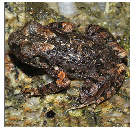
Leptobrachella wuhuangmontis Wang, Yang & Wang, sp. n.