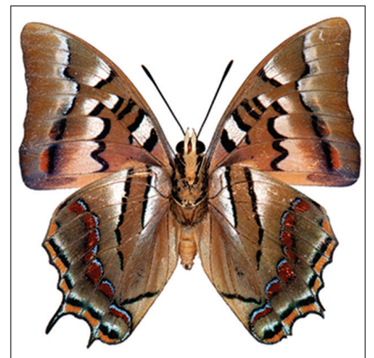
Polyura inopinatus Röber, 1940