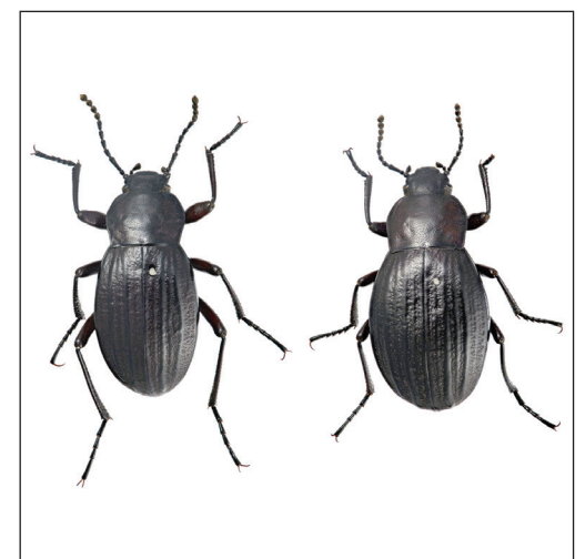
Blaptogonia zhentanga Li et al., sp. n.