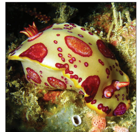
Hypselodoris dollfusi (Pruvot-Fol, 1933)