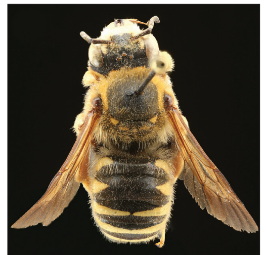
Trachusa balcanica Kasperek, sp. n.