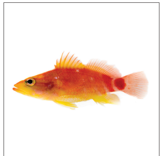
Plectranthias abiabiata Shepherd et al., sp. n.