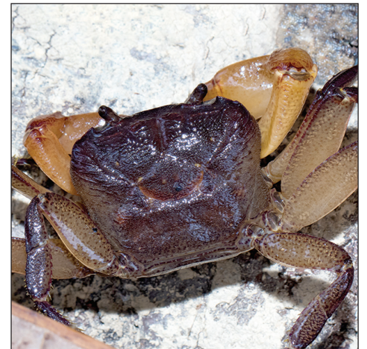
Thelphusula capillodigitus Ng & Ng, sp. n.