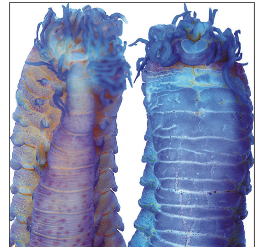
Thelepus marthae Jirkov, sp. n.