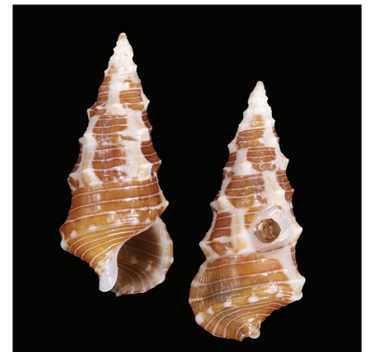
Limatium pagodula Strong & Bouchet, sp. n.