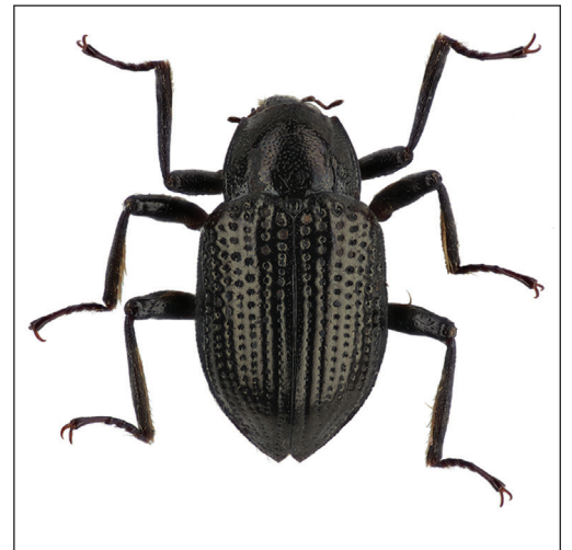
Grouvellinus leonardodicaprio Freitag et al., sp. n.