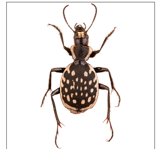
Graphipterus magnus Renan & Assmann, sp. n.