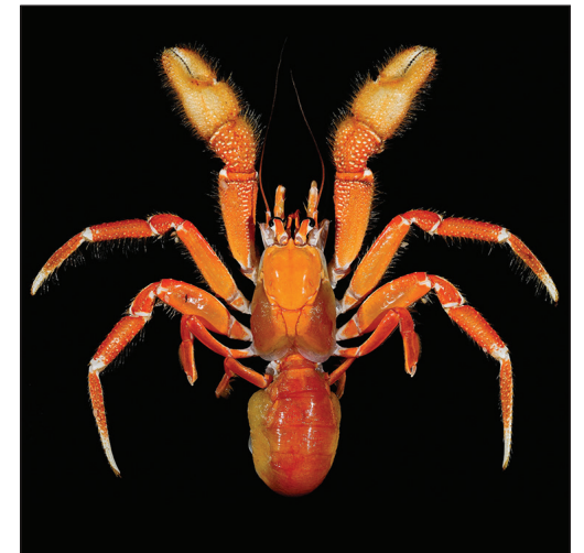
Paguroopsis gigas Lemaitre et al., sp. n.