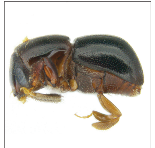
Scolytoplastypus unipilus Jordal