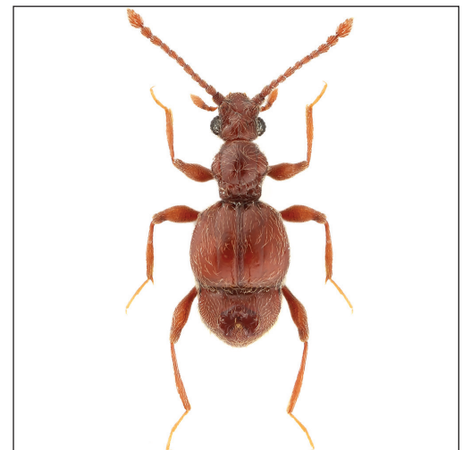
Arthromelodes choui Yin, sp. n.