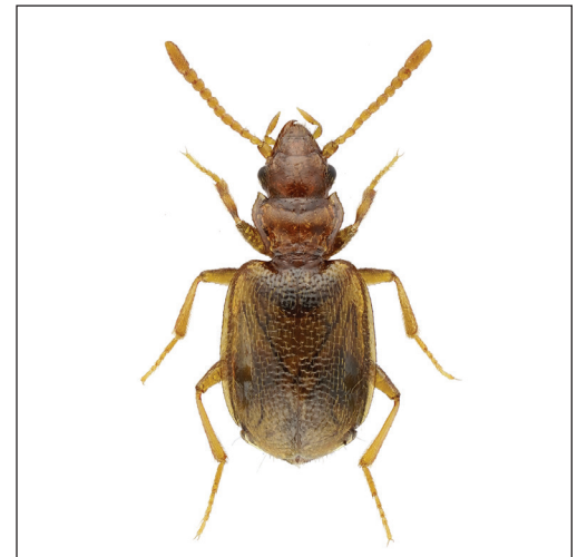
Eustra shanghaiensis Song, sp. n.