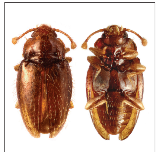
Lycoperdinella boliviensis Arriaga-Varela et al., sp. n.