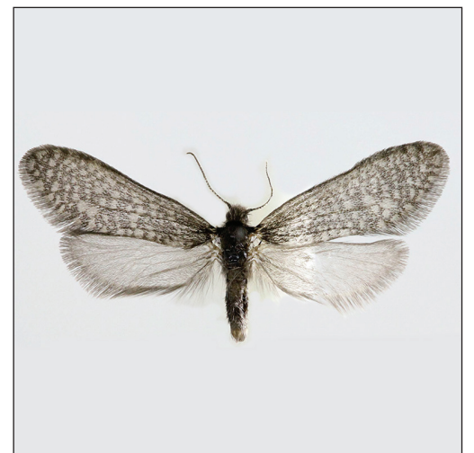
Dablica (Dablica) somae Roh & Byun, sp. n.