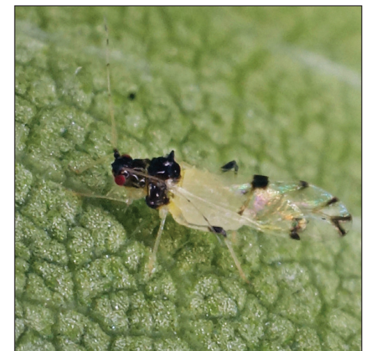
Tinocallis takachiboensis Higuchi, 1972