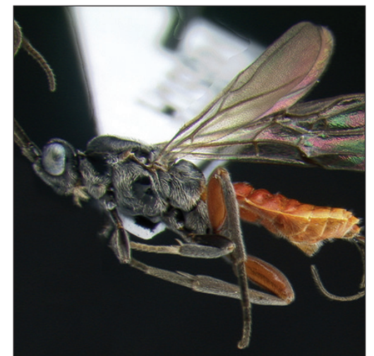
Lytopylus angelagonzalezae Kang, sp. n.