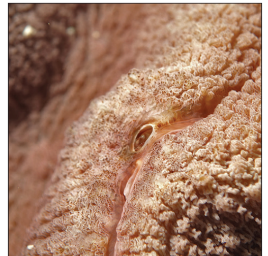
Galkinius maculosus Chan & Liu, sp. n.