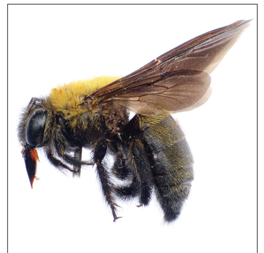
Xylocopa (Koptortosoma) sarawatica Engel, sp. n.