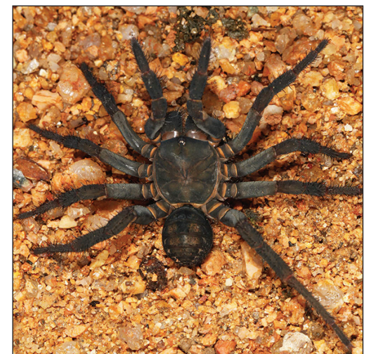
Qionghela bawang Xu et al., sp. n.