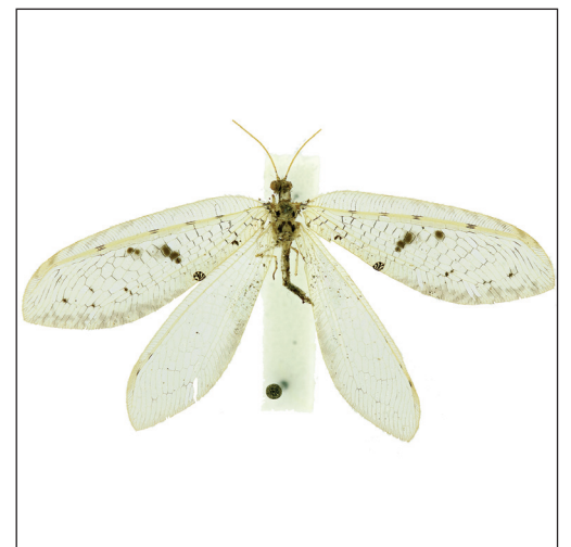
Spilosmylus tephrodestigma Badano & Winterton, sp. n.