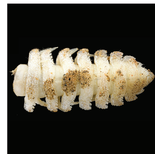
Trichopeltis intricatus Liu et al., sp. n.