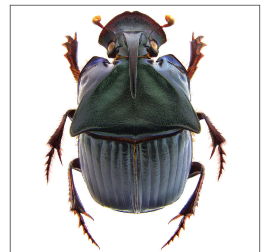
Phanaeus bravoensis Moctezuma et al., sp. n.