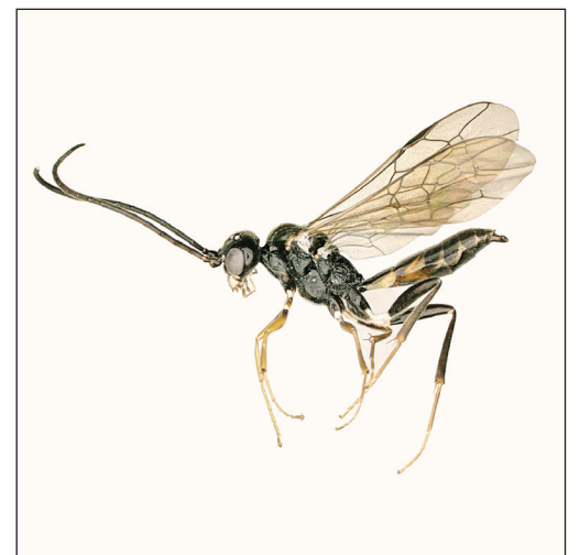
Orthogonalys paraclypeata Tan & van Achterberg, sp. n.