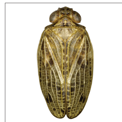
Tetricodes ansatus Chang & Chen, sp. n.