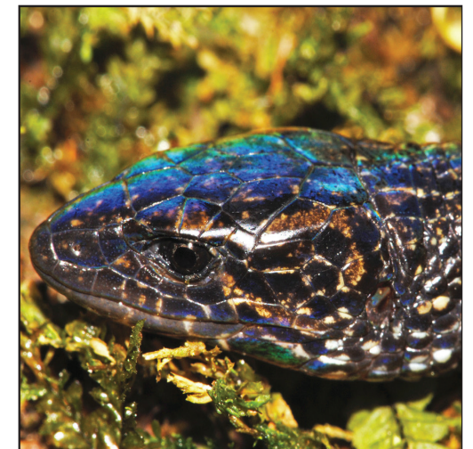
Oreosaurus serranus Sánchez-Pacheco et al., sp. n.