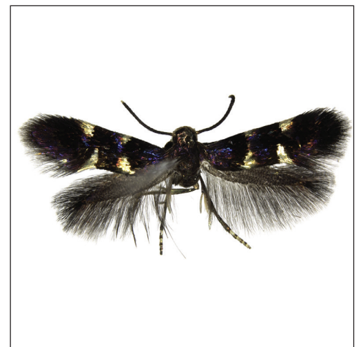
Antispila sinensis Liu & Wang, sp. n.