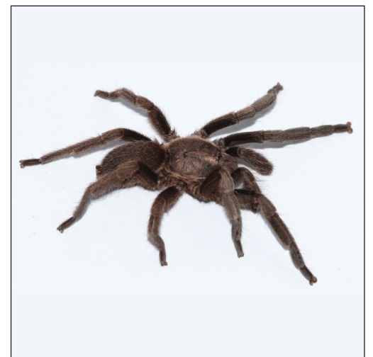
Phlogiellus longipalpus Chomphuphuang et al., sp. n.