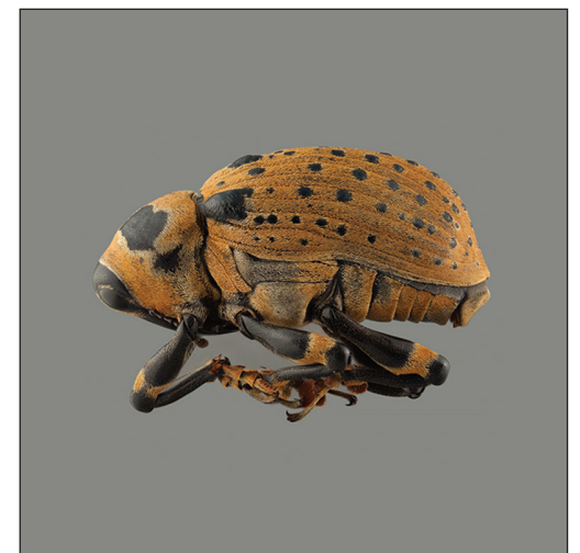
Cratosomus lafontii Guerin, 1844