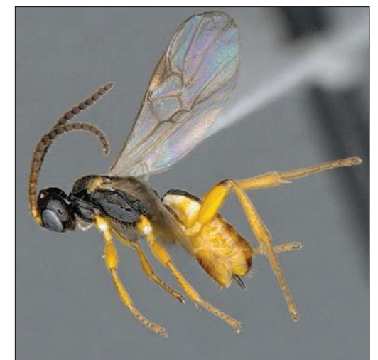
Cotesia typhae Fernandez-Triana, sp. n.