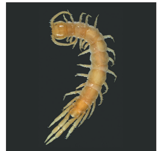
Lithobius crassipesoides Voigtländer, Iorio, Decker & Spelda, sp. n.