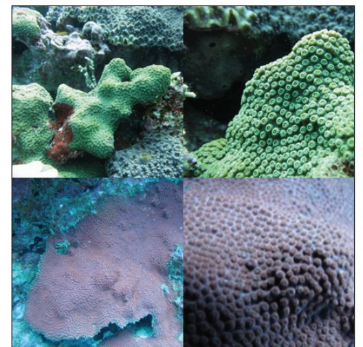
Cyphastrea salae Baird, Hoogenboom & Huang, sp. n.

ZooKeys Launched to accelerate biodiversity research