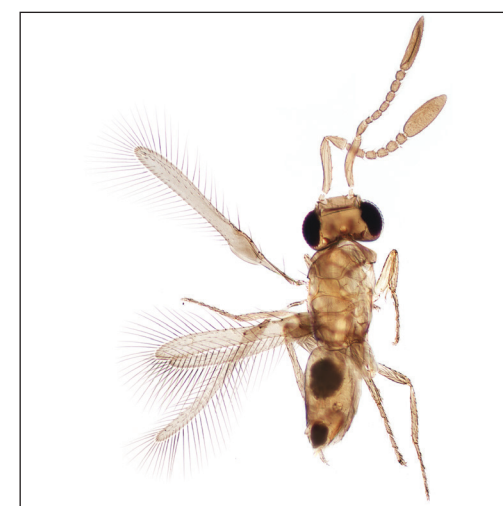
Cleruchus musangae (Mathot), comb. n.