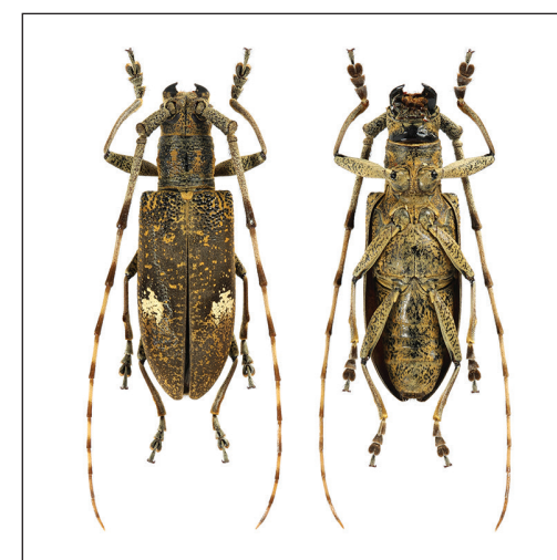
Pseudomacrochenus wusuae He, Liu & Wang, sp. n.