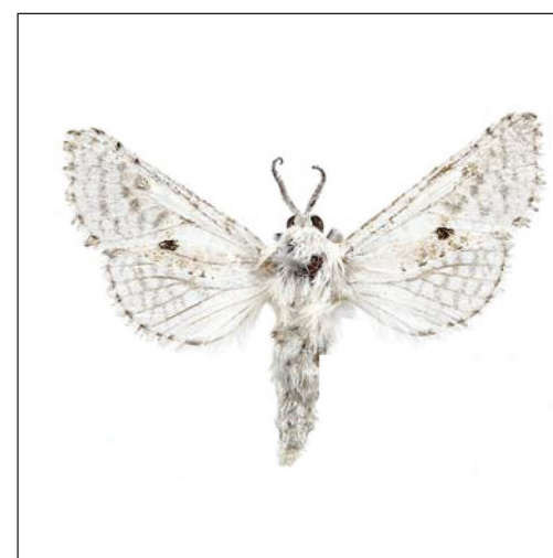
Givira delindae Metzler, sp. n.