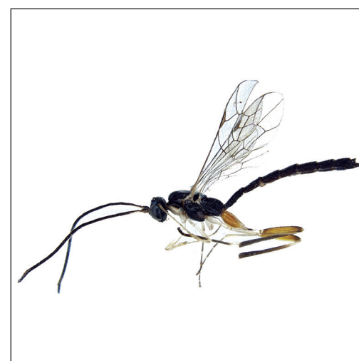
Poemenia quercusia Sun & Sheng, sp. n.