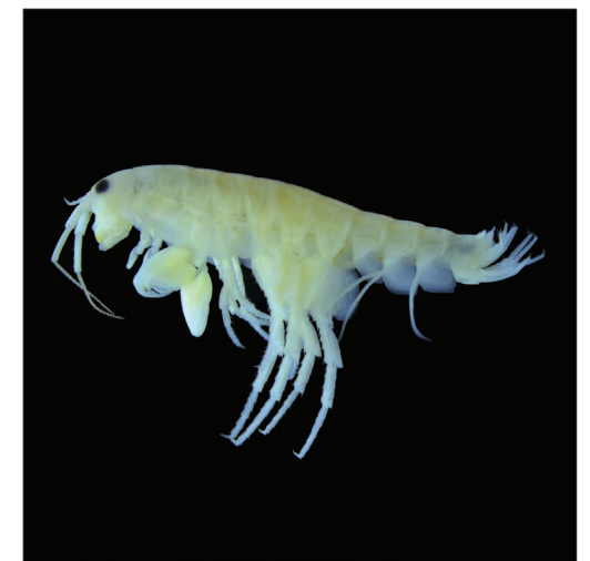
Cryptorchestia ruffoi Latella & Vonk, sp. n.