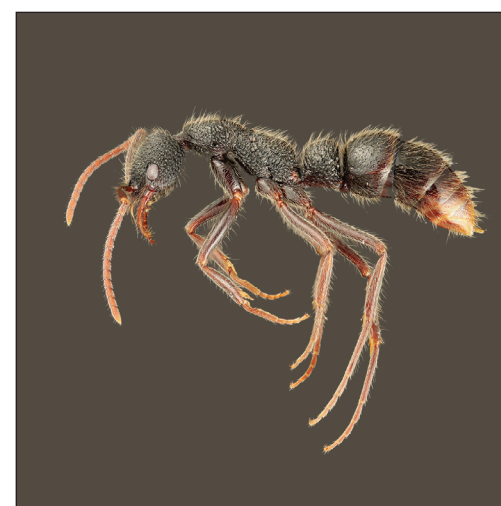
Leptogenys kanaoi Arimoto, sp. n.