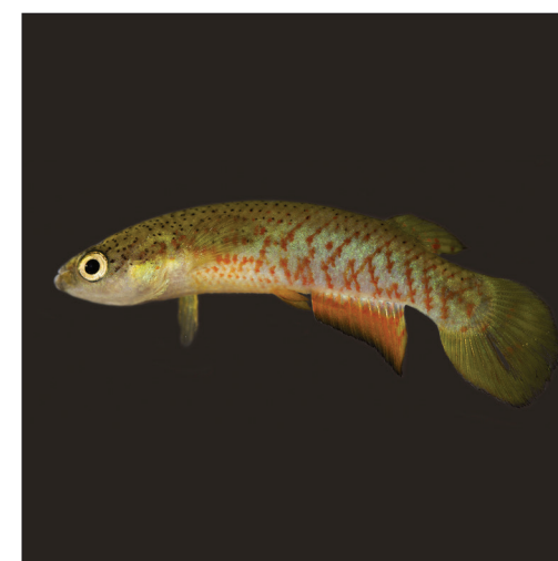
Melanorivulus ignescens Costa, sp. n.