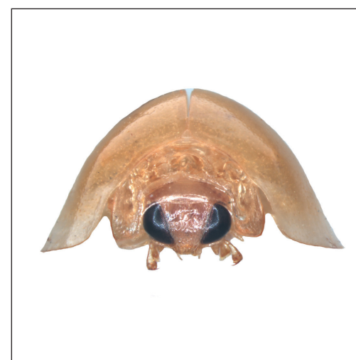
Phaenochilus albomarginalis Li & Wang, sp. n.