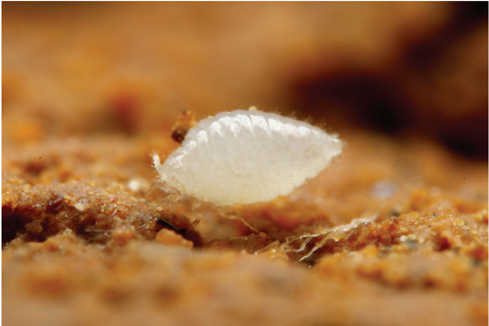
Figure 1. A mature adult female of Ishigakicoccus shimadai sp. n.

Slide-mounted specimens. Body elongate oval, slightly pyriform, 721–895 \mu\text{m} long, 379–632 \mu\text{m} wide. Eye spot absent. Antennae 5 segmented, 1 st : 18.4–29.5 \mu\text{m} long, 2 nd : 13.7–18.4 \mu\text{m} long, 3 rd : 15.8–26.3 \mu\text{m} long, 4 th : 17.1–22.1 \mu\text{m} long and 5 th : 36.8–41.3 \mu\text{m} long. The fifth segment with three fleshy setae. Anterior spiracles each 20.8–28.7 \mu\text{m} wide across atrium; posterior spiracles each 16.8–29.7 \mu\text{m} wide across atrium. Legs well developed, length of posterior pair: coxa 45.8–55.2 \mu\text{m} long, trochanter + femur 123–133 \mu\text{m} long, tibia + tarsus 112–122 \mu\text{m} long, claw 33.4–39.4 \mu\text{m} long. Ratio of lengths of tibia + tarsus to trochanter + femur 1.05–1.11. Claw digitules setose, each 3.2–6.1 \mu\text{m} long.