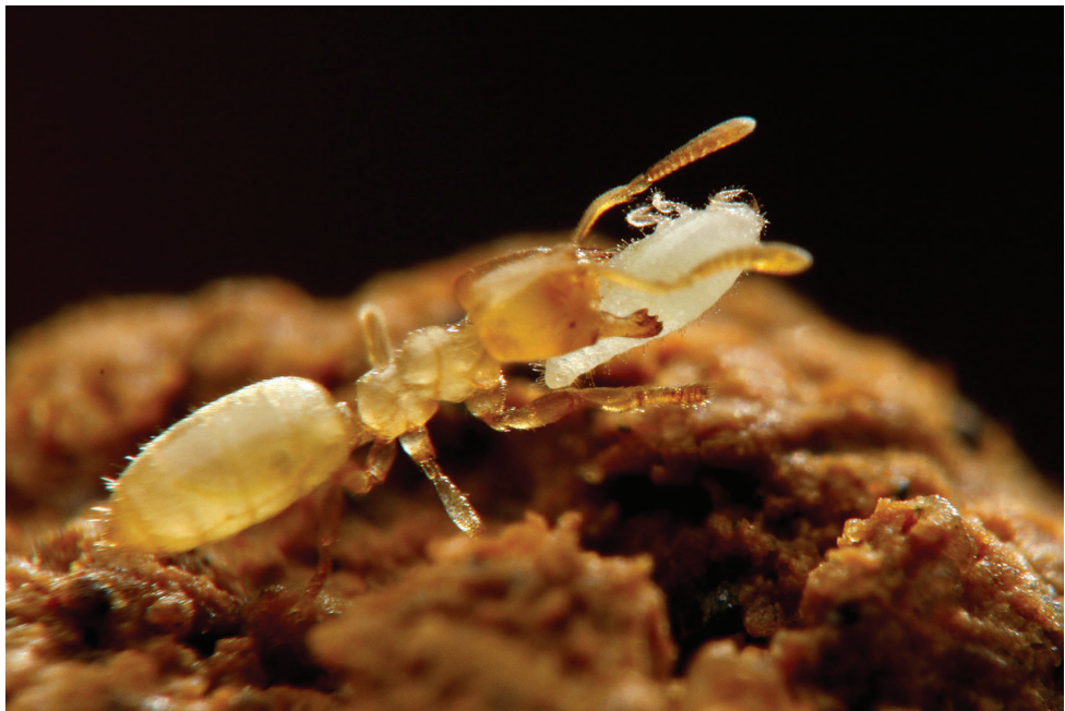
Figure 2. An adult female of Ishigakicoccus shimadai sp. n. being carried by Acropyga yaeyamensis .

setose setae, 10.5–37.4 \mu\text{m} long, each with a pointed apex. Both setae distributed in transverse segmental bands. Multilocular pores each about 2.9–3.7 \mu\text{m} in diameter, each with 5–6 loculi, frequently present and evenly distributed on all areas of venter. 3–5 locular pores, each 5.8–7.9 \mu\text{m} in diameter, without central hub, present on medial area of abdominal segments III–VI in transverse rows. A circulus, 10.5–18.4 \mu\text{m} long and 21.0–33.2 \mu\text{m} wide present on medial anterior border of abdominal segment II. Tritubular and bitubular pores absent. Oral collar tubular ducts absent.